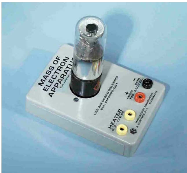
AP2120-001 Mass of Electron