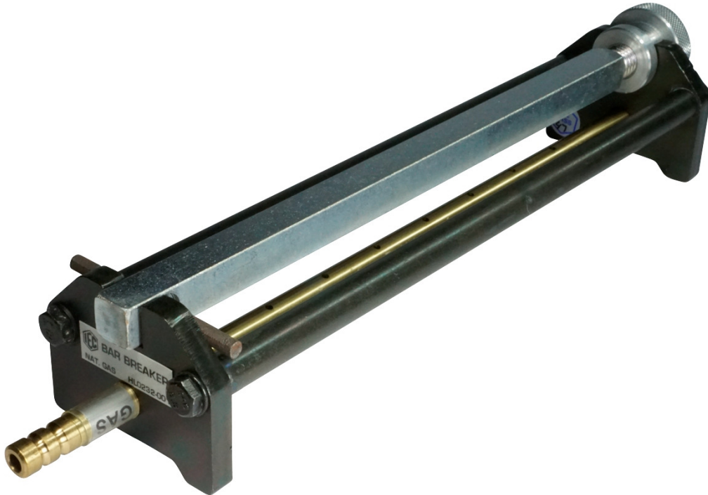
HL0232-001 Natural Gas