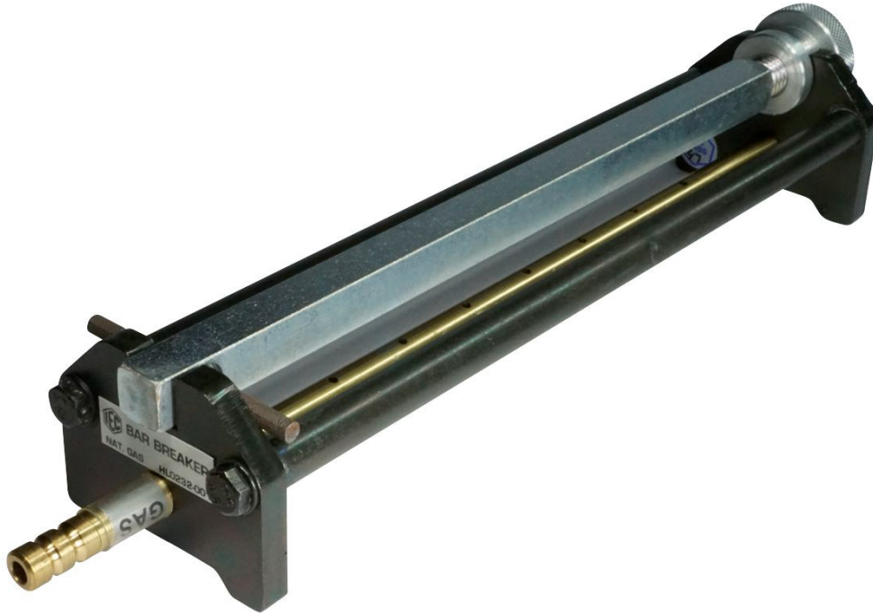
HL0232-001 Natural Gas