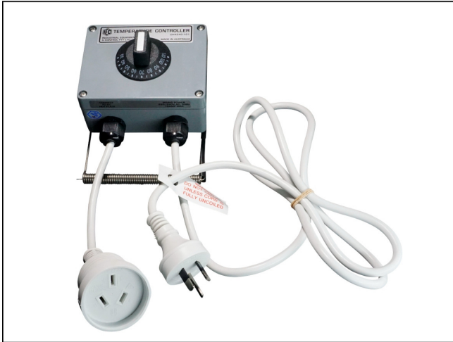
Temperature controller CH4240-101