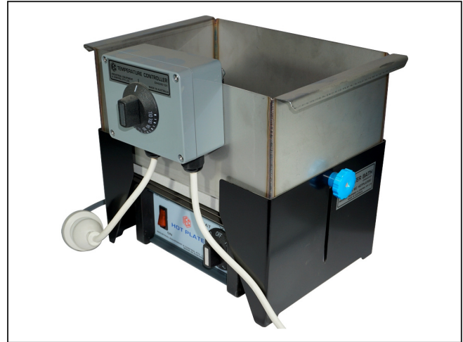
Fitted to Water Bath