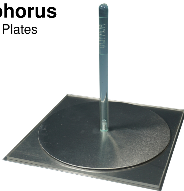
EM1782-001 ( 150mm Diameter )