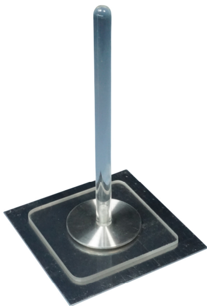
EM1780-001 ( 50mm Diameter )